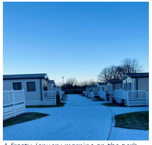
A frosty January morning on the park