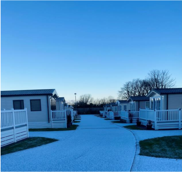
A frosty January morning on the park